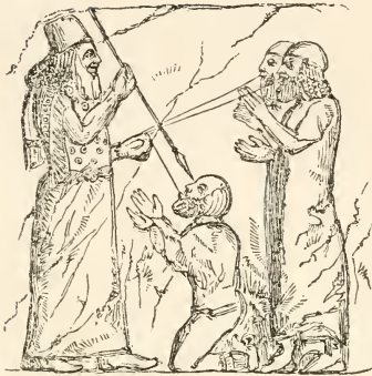
PUTTING OUT THE EYES.

king is thrusting the point of his spear into one of the eyes of the suppliant before him, while with his left hand he holds the ends of cords fastened to the upperlips of the other captives, who are manacled and fettered, and standing behind the one whose eyes are about to be put out. The king is attended also by his cup-bearer and officers of state, bearing sceptres; by a eunuch and the chief governor, or Rab Signeen . Who knows but that this is the history of king Zedekiah from II. Kings illustrated? At least, in the picture we easily recognize his fate, and the putting out of Samson's eyes.